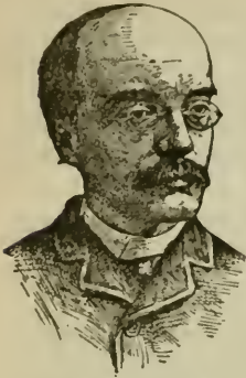
JOHN BACH MCMASTER.

H ISTORY OF THE PEOPLE OF THE UNITED STATES, from the Revolution to the Civil War. By JOHN BACH MCMASTER. To be completed in five volumes. Vols. I, II, and III now ready. 8vo, cloth, gilt top, $2.50 each.